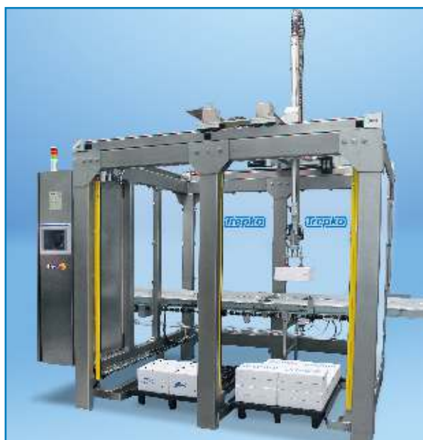
Double Gantry Palletiser