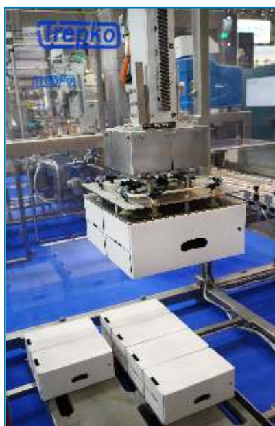
Single Gantry Palletiser